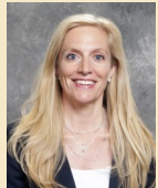
Dr. Lael Brainard