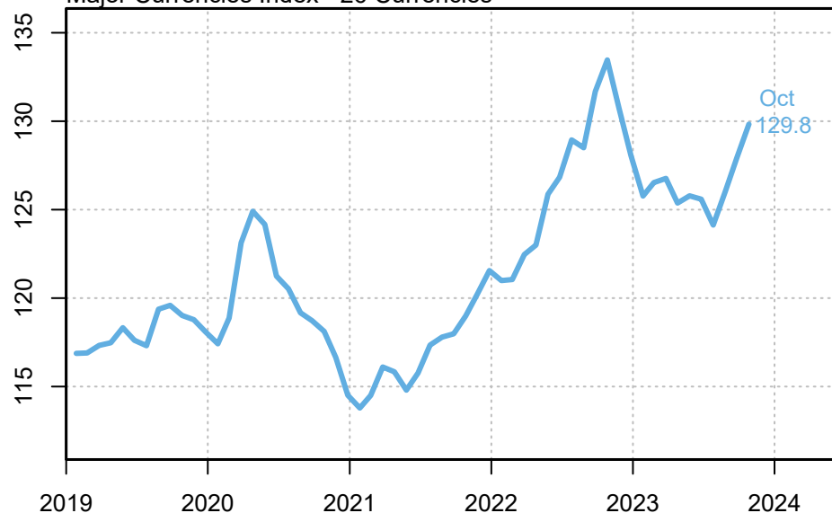
U.S. dollar (real) Major Currencies Index - 26 Currencies