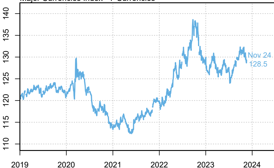
U.S. dollar (nominal) Major Currencies Index - 7 Currencies