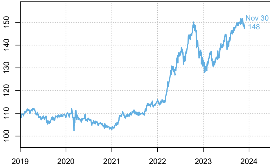
Yen per Dollar